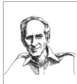
Dr. Archie Carr, Jr.

The refuge was designated by Congress in 1989 and named after world-renowned ecologist Dr. Archie Carr, Jr. in honor of his contributions to the understanding and conservation of sea turtles.